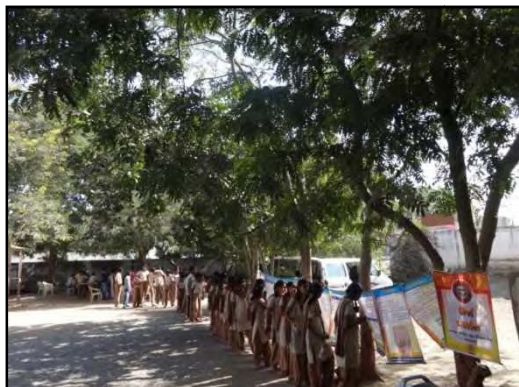
Chart and Model Exhibition

An exhibition, in the most general sense, is an organized presentation and display of a selection of items. Exhibitions can include many things such as art & Science. KRCSC carried out Science models and chart exhibition.